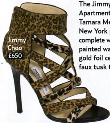
Jimmy Choo £650