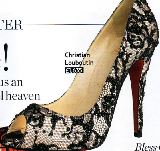
Christian Louboutin £1,635

The opening of Selfridges Shoe Rooms, plus an orgy of other foot-related happenings – heel heaven